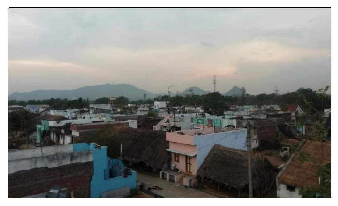
P1: a view of the village on a lockdown day evening; photo taken by respondent from house terrace

The major crops grown in Mettavalasa are paddy, sugarcane, maize and cotton in the kharif season and paddy and vegetables during the rabi season. The village is near a designated Andhra Pradesh industrial development area, which is known locally as 'growth centre' and houses between thirty and forty industrial units. Many workers from the village are employed in these industrial units.