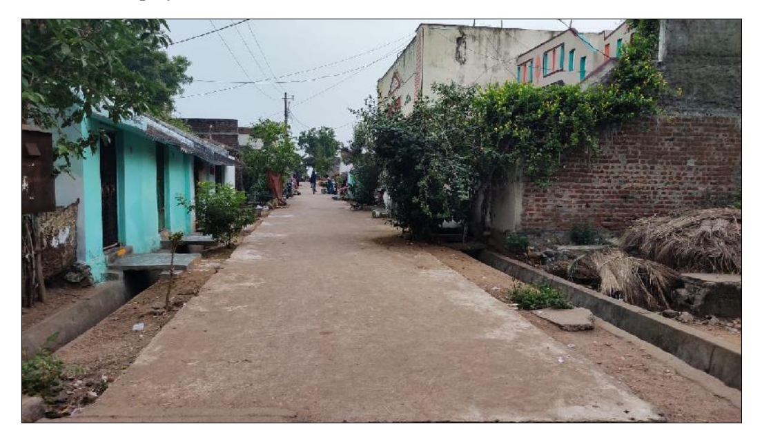
P2: an interior road through the village; few villagers are seen sitting in front of their houses

Typically, farm labour wage rates in the village are Rs 100 to 150 per day for women and Rs 200 to 250 per day for men. The daily wage rate on an average for factory workers is Rs 300 to 600 per day for skilled and semi-skilled migrant workers and Rs 300 to 350 per day for unskilled local labour. Migrant workers are usually paid monthly depending on the type of work they are engaged in and on the factories they are employed at. Most factory workers have not received any payment since the beginning of lockdown, and many migrant workers (around 200 to 250, according to my respondents) from Chennai, Vijayawada, and Orissa are stranded here. Most continue to stay in the accommodation arranged for them by their employers, while some have rented houses in villages around the growth centre. All industrial activity, including mining operations near the villages, has been stopped, leaving many workers unemployed.